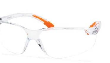
R1303 Safety Glasses