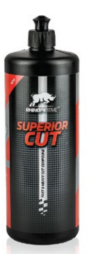
R1822 Superior Cut 1L