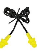
R1319 Noise Reduction Ear Plugs