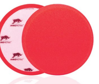
R1829 Exceptional Waxing Pad 150mm