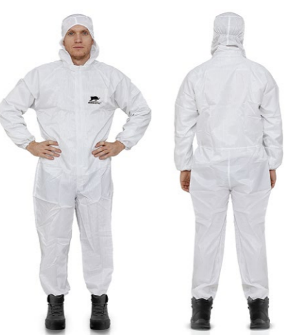
R1311-R1315 Reusable Coverall