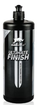
R1826 Ultimate Finish Polish 1L