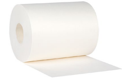
R1818 Surface-Preparation Degreasing Wipes