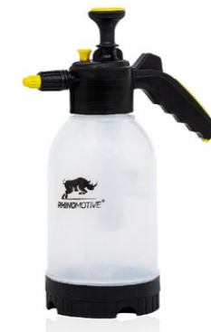
R1844 Detailing Pump spray Bottle