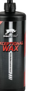
R1828 Exceptional Wax 1L