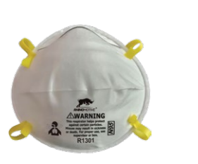
R1301 Particulate Dust Mask