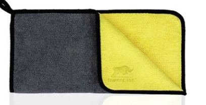
R1806 Polish and Final touch Microfibre Cloth