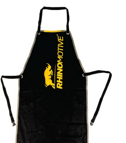
R1326 Polish Apron