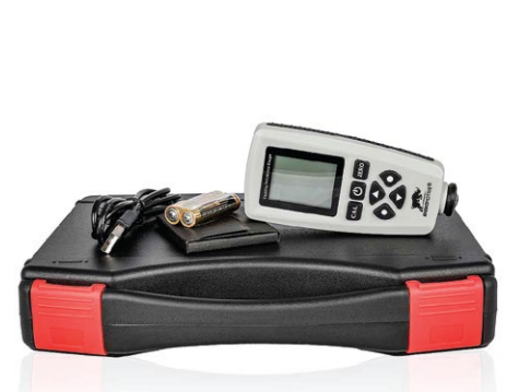
R1154 Paint Thickness Gauge