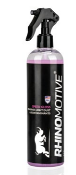
R2204 Speed Gloss 500ml