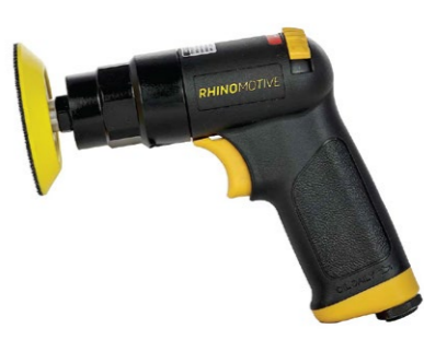
R1122 Mini Air Polisher