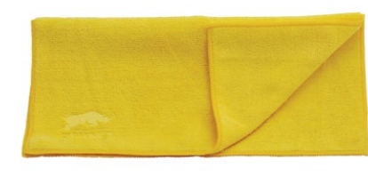
R1804 Detailing Microfibre Cloth - Yellow