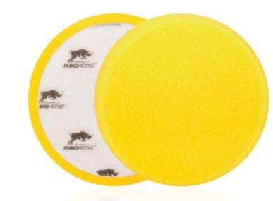
R1831 One Step Polishing Pad 100mm