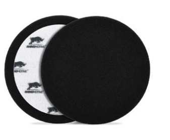
R1854 Ultimate Finishing pad 100mm