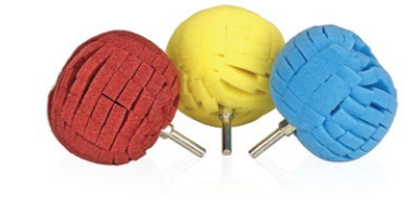
R1876 Ball Polishing Foam