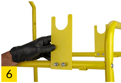
4.6. Use Parts (2) (3) (4) to install the holder for polishing machines