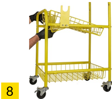
4.8. Install the Upper Net Basket (14)