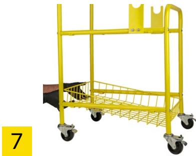
4.7. Install the Bottom Net Basket (13)