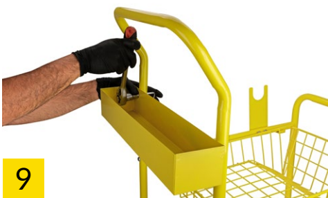
4.9. Use Bolt (1) to install the Storage Box

PRO | USE IT AND SEE SERIES | THE DIFFERENCE