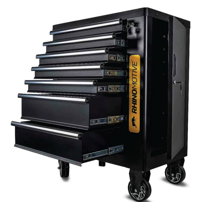
R1179 Tools Trolley