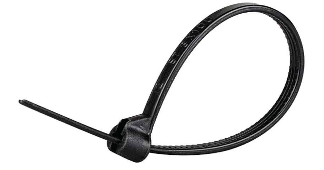
R2109 / R2112 Metal Inlay Cable Ties Black