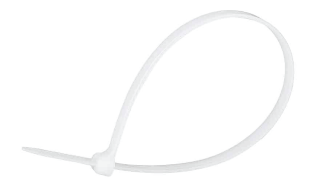
R2111 / R2113 Metal Inlay Cable Ties white