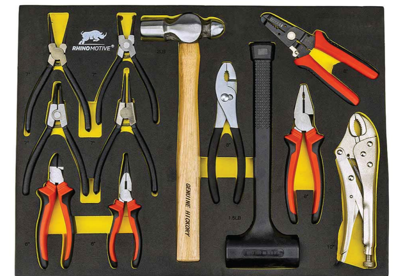
R3122 Comprehensive Pliers Tools Set