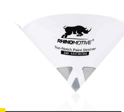
R1422/R1423 Top-Notch Paint Strainer