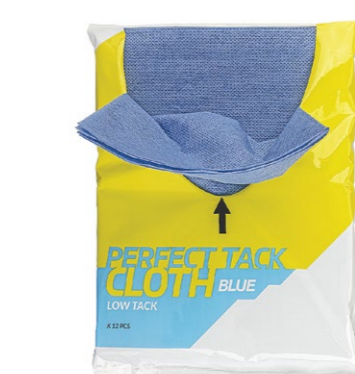
R1442 Perfect Tack-Blue