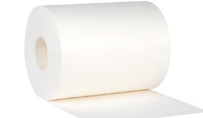
R1818 Surface-Preparation Degreasing Wipes