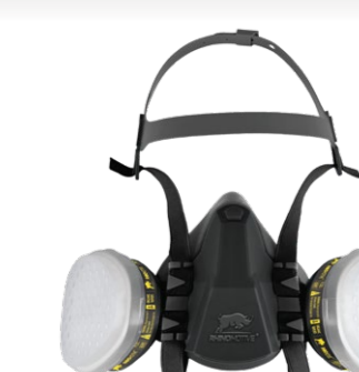
R1320 Reusable Respirator RHINOMOTIVE Half Mask