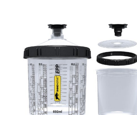
R1405-R1412 EPP 200 micron and 125micron. Mini 180ml, Standard 650ml and Large 850ml