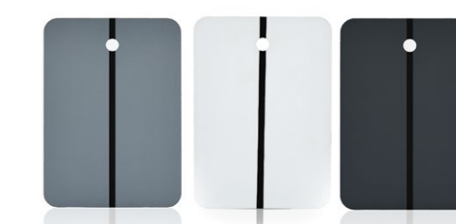
R1427/R1426/R1443 Metal Spray Cards Gray, White and Black to match the primer colors in the market.