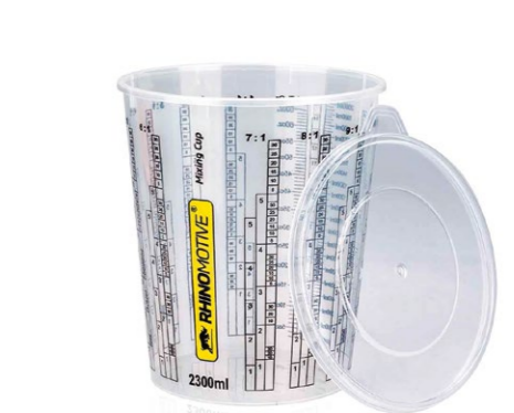
R1401-R1404 Expert Paint Mixing Cups