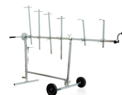
R1102 Rotary Paint Panel Stand