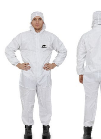
R1311-R1315 Reusable Coverall