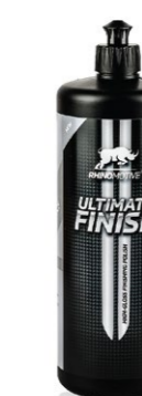
R1826 Ultimate Finish 1L