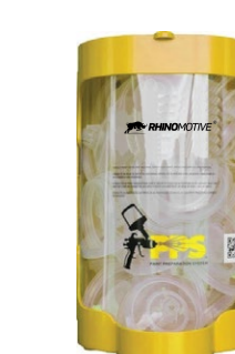
EPP Liner and Cup Dispenser