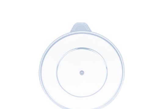
R1428-R1431 Flexi Lids