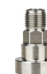
R1413-R1421 Adaptors for Spray Gun brands: Sata, Devilbiss, Sagola and Iwata