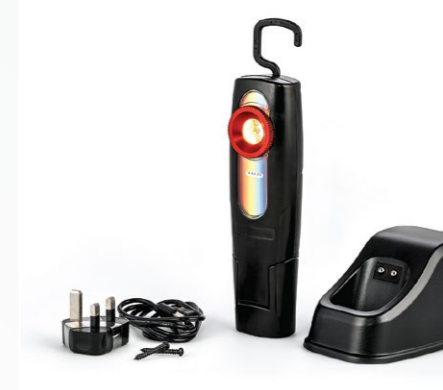
R1141 Hybrid Color Inspection Light